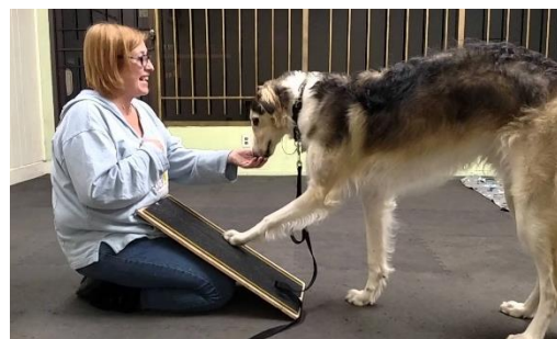
Position your scratch board at an angle