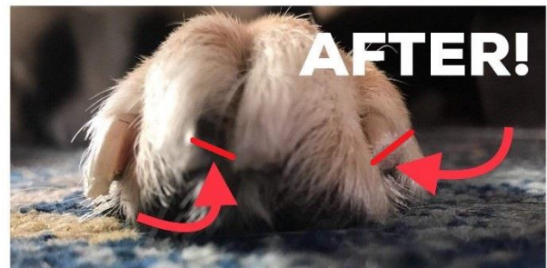
A few minutes with a scratch board shortened these nails substantially!